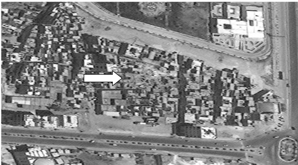
Digital Globe World View 1 – 27 July