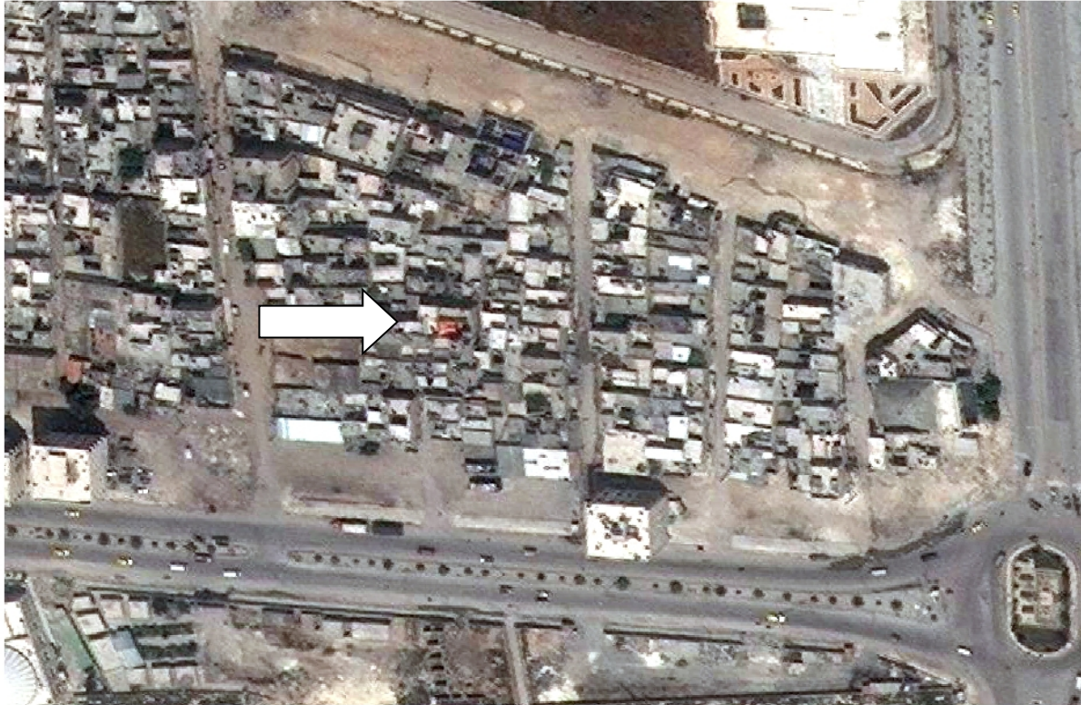
Digital Globe World View 1 – 13 May